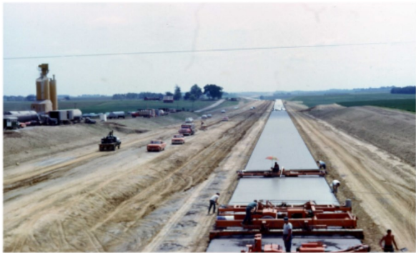
Construction of I-80 near Williamsburg, IA in late 1960's

The world now demands that digital media be fast and easy to use, the paper photo products of the past do not fit. BRING IT BACK SCANNING AND ARCHIVING is here to help anyone who has stockpiles of photos/videos and wants to convert them to a digital format.